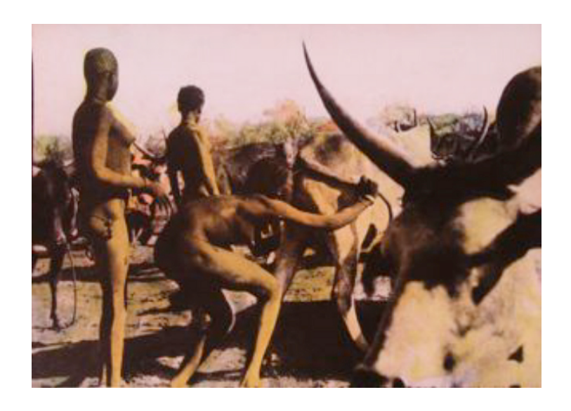
Henry de Monfreid. Chancalla makes the milk come, 1930

De Monfreid died at the age of 95, leaving a great legacy as a result of the use of his freedom.