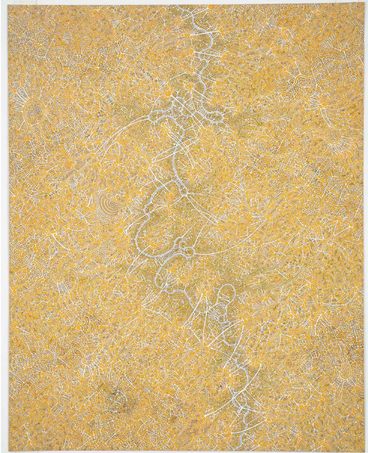
Foregone Conclusion , 2018 Ink and acrylic on paper 50.8 x 40.4 cm