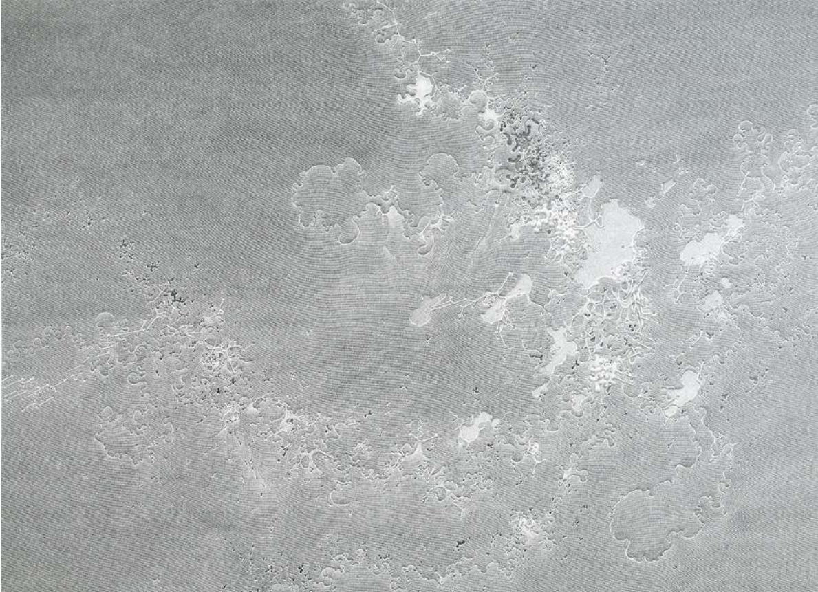
Polymorphic Reservoir , 2013 Grafite on paper mounted on wood panel 114 x 152 cm