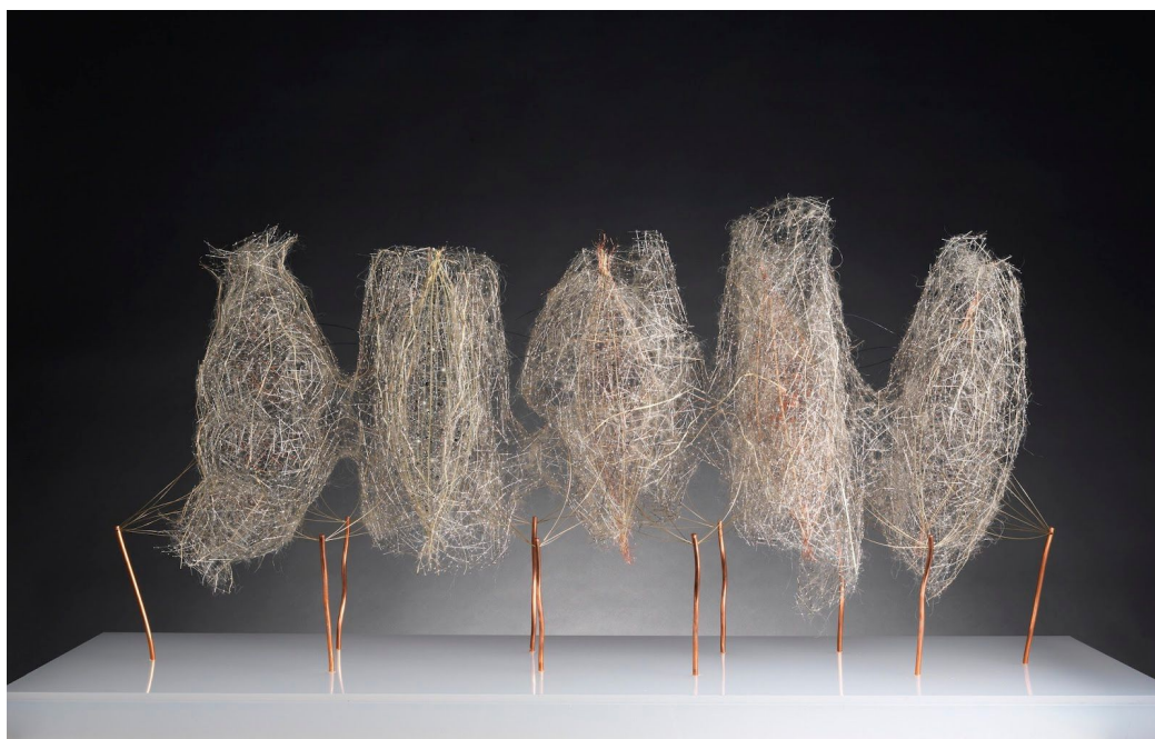
'Pentámero' 2018, Pins, wire, vegetable material on methacrylate 70 x 138 x 60 cm © Carlos Tarancón

On the occasion of the opening of the season at Apertura 2019 , we have the great pleasure of presenting the individual ' Recent Work ' by Antonio Crespo Foix (Valdepeñas 1953). The exhibition brings together his latest works in which he delves into the formal and conceptual language that characterizes his work.