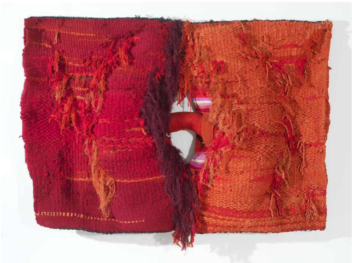
Ligam 1973 Wool, cotton and syntetic fibers 120 x 167 cm

Michel Soskine Inc. is pleased to present during "Apertura Madrid Week End" the second exhibition of one of XXth century most important contemporary textile artist Josep Grau-Garriga (1929-2011): 12 tapestries from 1972 to the years 2000 will show the evolution of an oeuvre that transit from early political and stormy works made in Cataluña to later more playful and sculptural creations while he was living in Saint Mathurin, in the French region of Angers, - known for its " douceur de vivre ".