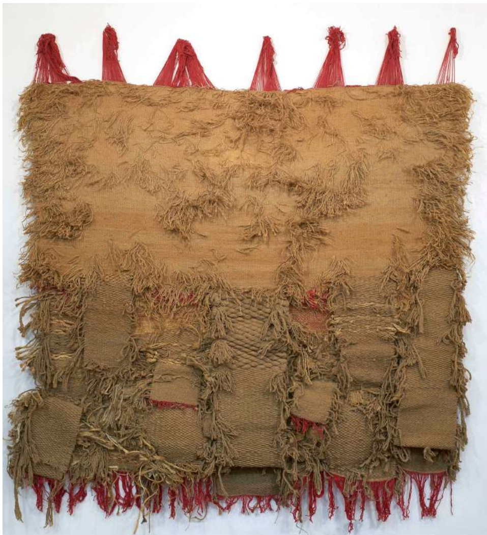
Textures fan mar 1974 Wool and jute 220 x 225 cm

In 2013 the Musée d'Art Moderne de la Ville de Paris in its collective exhibition ' Decorum ' dedicated to textile art , paid homage to Grau-Garriga as well as other major textile artists such as Maryn Varbanov, Jagoda Buić or Annette Messenger,