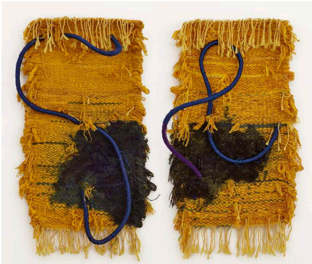
Diptych 1980 Wool and jute 120 by 127 cm

'I realized that I could think and execute a tapestry using any kind of 'string' that was within my reach at any given time and that it seemed to me that its presence in textile weaving was necessary and effective'.